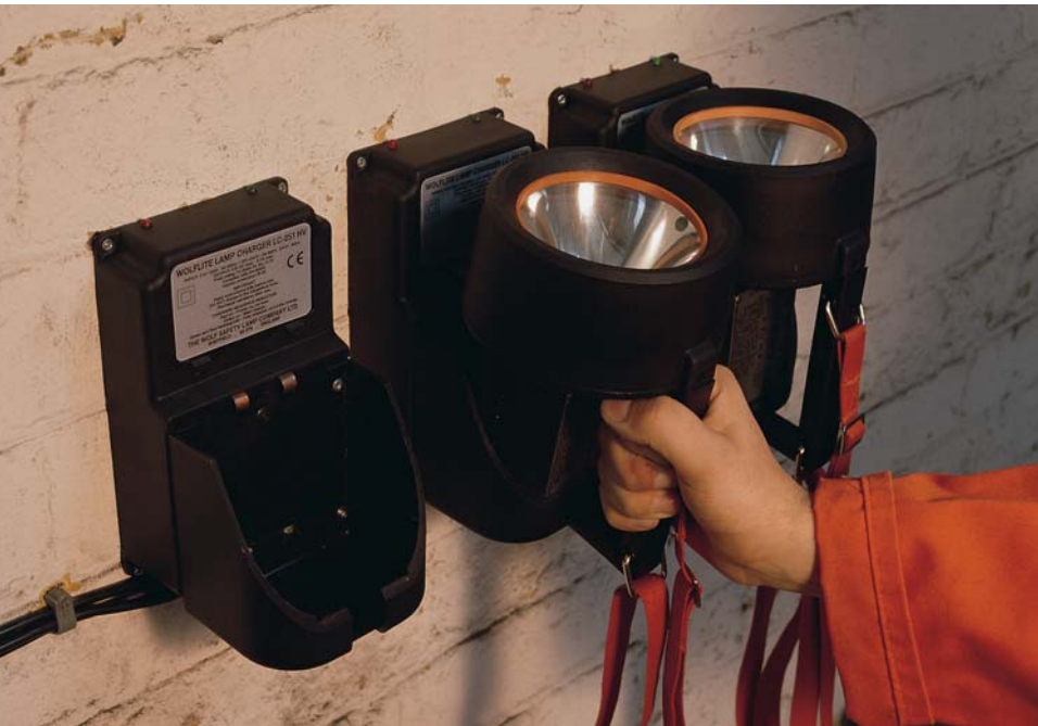
Wolflite H-251 Mk2 with C-251 HV charger