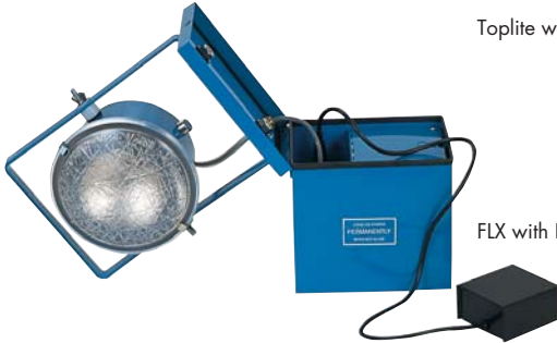
FLX with FL-F87A charger