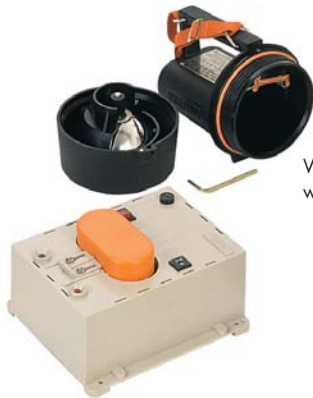
Wolflite H-251 Mk1 with C-251 charger