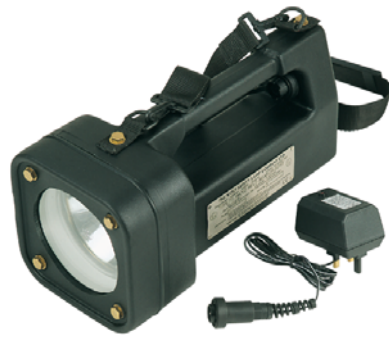
Toplite with TL-9052T3 charger