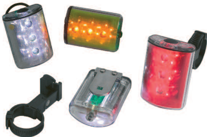
LiteTracker LT-131 and Bikelite LT-131B LED medium angle beam (approx 15°) Peak luminous intensity at 1m 14 lux, at 2.5m 2 lux