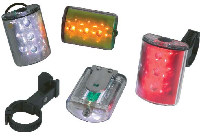
LiteTracker LT-131 and Bikelite LT-131B LED medium angle beam (approx 15°) Peak luminous intensity at 1m 14 lux, at 2.5m 2 lux