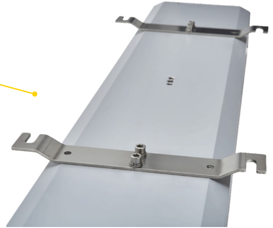
An LMX Linear with ceiling mounts

Allows LMX luminaires to be mounted on flat wall and ceiling surfaces.