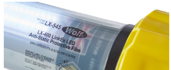
LX-545 Hazardous Area Certified Anti-Static Protection Film

LX-545/3 Anti-Static Protective Film (Hazardous Area Certified) - The Hazardous Area certified, anti-static LX-545/3 Protective Film can be attached to a luminaire to protect it from dirt, paint and other contaminants to increase the life of the product, whilst still allowing excellent light output. Lamps supplied as new are fitted with one film. Each additional LX-545/3 kit contains 3 films.