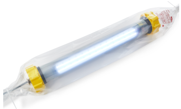
LX-621 Hazardous Area Certified Anti-Static Protection Bag

LX-621 Anti-Static Protection Cover Kit (Hazardous Area Certified) - The Hazardous Area certified, anti-static LX-621 protection pack protects the light from dirt, paint and other contaminants. Covering the entire light, cable gland, end caps and link socket if fitted. Particularly useful in sewerage type environments, the protective cover seals around the power cable with the cable ties provided, minimising potential damage to the light and helping to extend its useful life. Each kit contains 5 bags. (Ambient temp reduced to 45°C when protective cover is fitted)