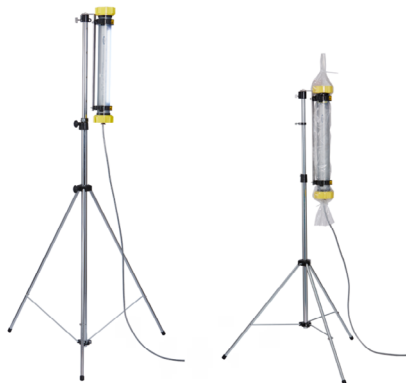
LL-668/35 & LL-699/18 Tripods with LL-670 Mounting Bracket

Wolf's tripods give a stable platform allowing the luminaire to be attached with the LL-670 Tripod Bracket Kit and used at a variety of heights and positions to deliver vertical or horizontal forward facing light, in the horizontal position the light can be directed upwards, illuminating the work area from the underside.